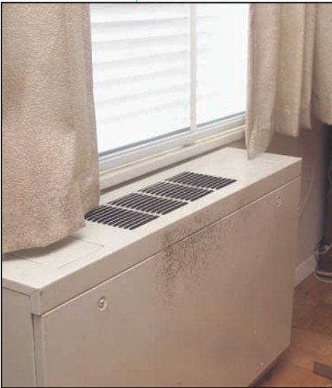
Mold growing on the surface of a unit ventilator.