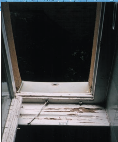
Leaky window – mold is beginning to rot the wooden frame and windowsill.

If you already have a mold problem – ACT QUICKLY. Mold damages what it grows on. The longer it grows, the more damage it can cause.