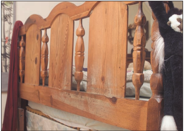
Mold growing on a wooden headboard in a room with high humidity.